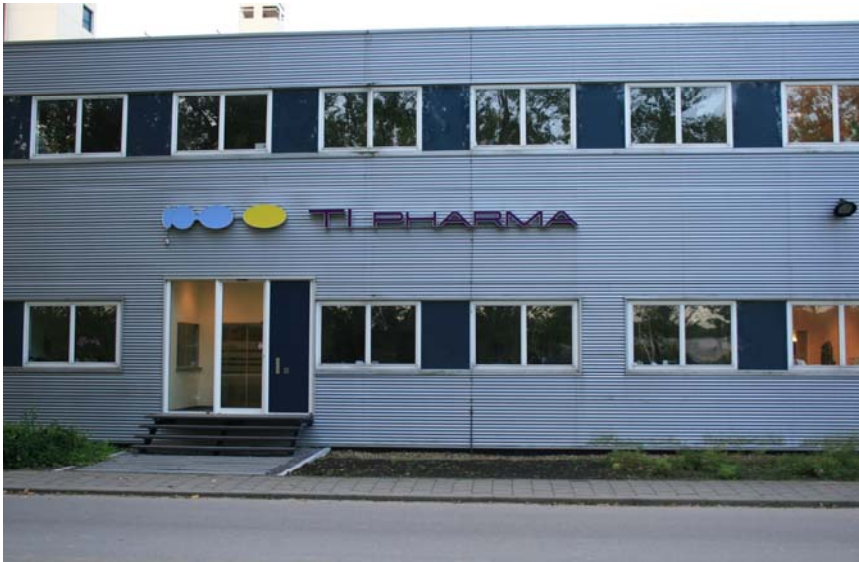
Entrance TI Pharma, at the Leiden BioScience Park.

Tel.: 31 (0)71 332 2030 - Fax: 31 (0)71 332 2031 - Email: info@tipharma.com